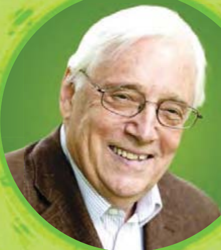
Professor Sir John E. Walker

Nobel Laureate in Chemistry (1997), U.K.